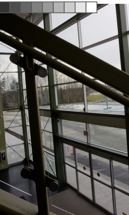
outside change room